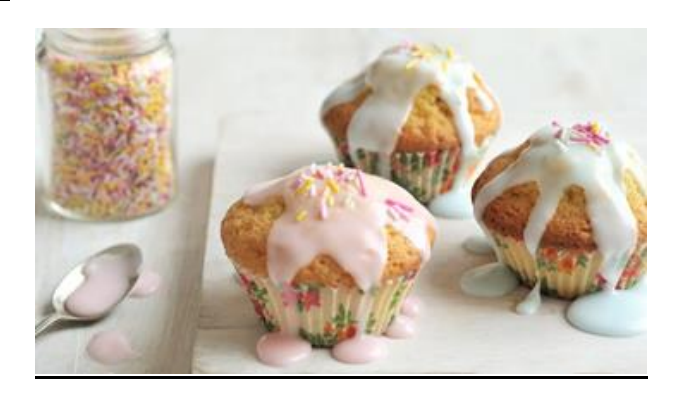
(Link - Science: Materials and Change - Mixing materials)