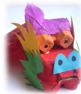
Egg Box Chinese Dragon Link to instructions