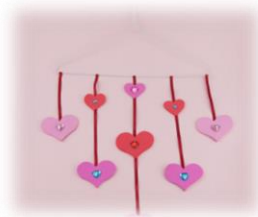
Valentine's Day Heart Mobile http://bit.ly/3aBm7ai