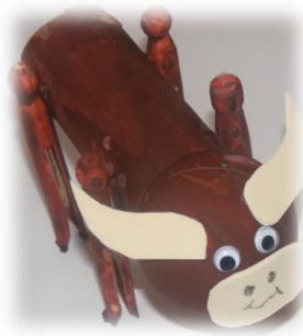
Toilet Roll Insert Ox Link to instructions