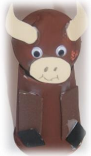
Paper Cup Ox Link to instructions