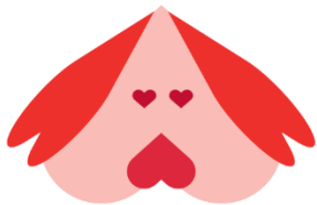
Love Heart Puppy Collage http://bit.ly/3tuXIRN

Try some romantic Valentine's Day crafts or make your own Valentine's Card for someone.