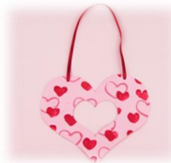
Valentine's Heart Shaped Wreath http://bit.ly/2O2Lr1j