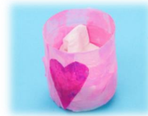
Plastic LED light holder http://bit.ly/2YHJvgQ