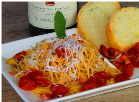
A favourite lunch of spaghetti Bolognese, wine and garlic bread.