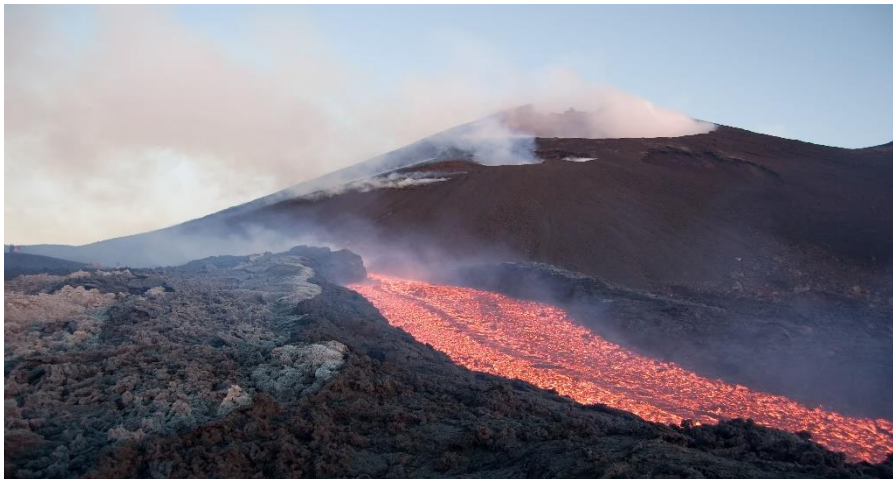
Facts about Volcanoes.

Mount Etna is an active volcano that is found in Sicily. Mount Etna is one of the world's most active volcanoes and is in an almost constant state of activity. Lava is hot liquid that can flow from a volcanoes