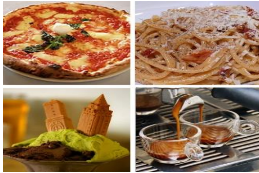
Italian food Pizza, spaghetti Bolognese, ice cream and coffee