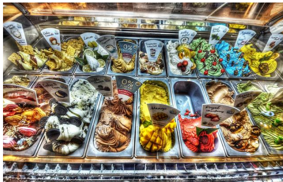
Italian ice cream